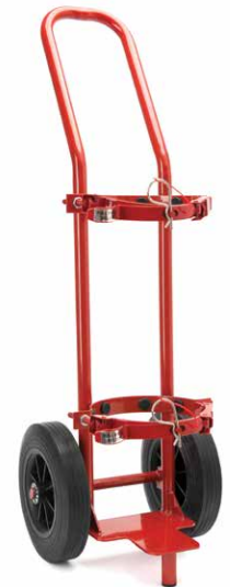
Shown with 30 lb ABC