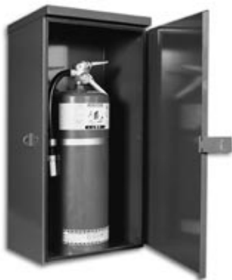
Model CE-1000 Outdoor Cabinet

Model CE-950-5 & CE-950-6: Provide and install N.F.E. Model CE-950-5 (12" X 30" X 8") OR CE-950-6 (12" X 35" X 8") recessed fire extinguisher cabinet constructed of 18 ga. (1.19mm) steel tub and 14 ga. (2mm) steel door & trim with \frac{1}{2} " (13mm) return frame, a full length semi-concealed piano hinge and flush stainless steel door latch. Front section to have full 2" (51mm) adjustment to wall. Entire cabinet finished in baked enamel paint and glazed with \frac{3}{16} " (5mm) clear glass.